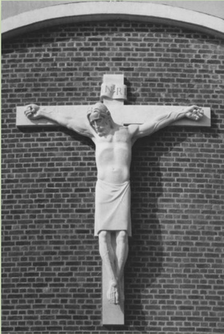
The finished work (left) with preliminary studies (below right)