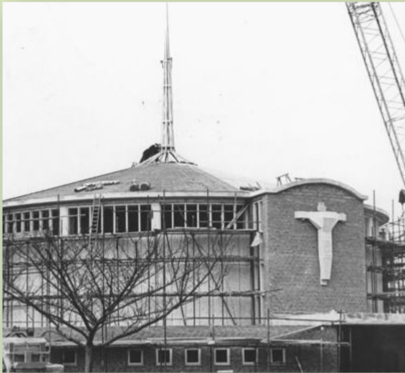
The stone blocks are installed prior to carving